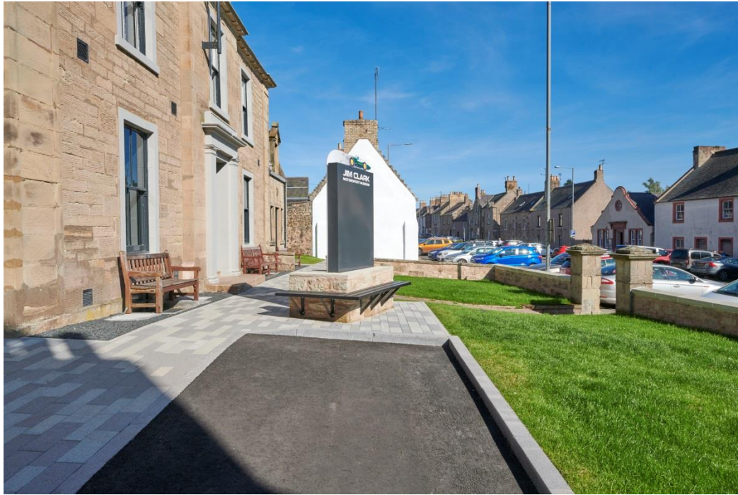
View of outdoor seating, on street parking and the front door parking space.