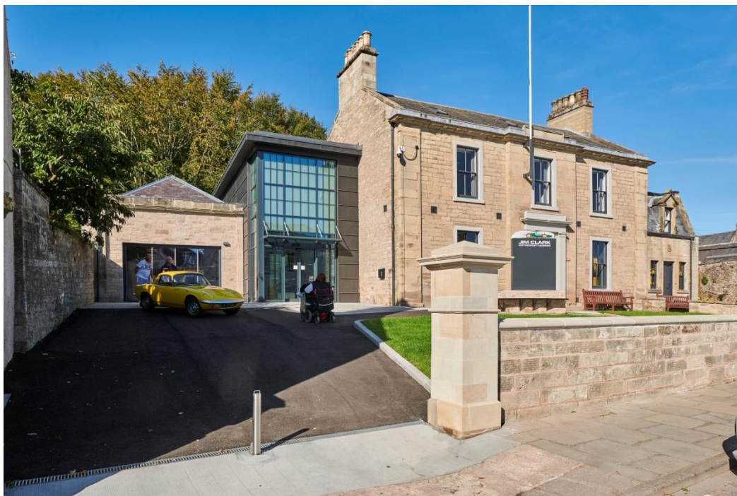
Bollard can be dropped for front door parking or drop off. Please call to arrange.