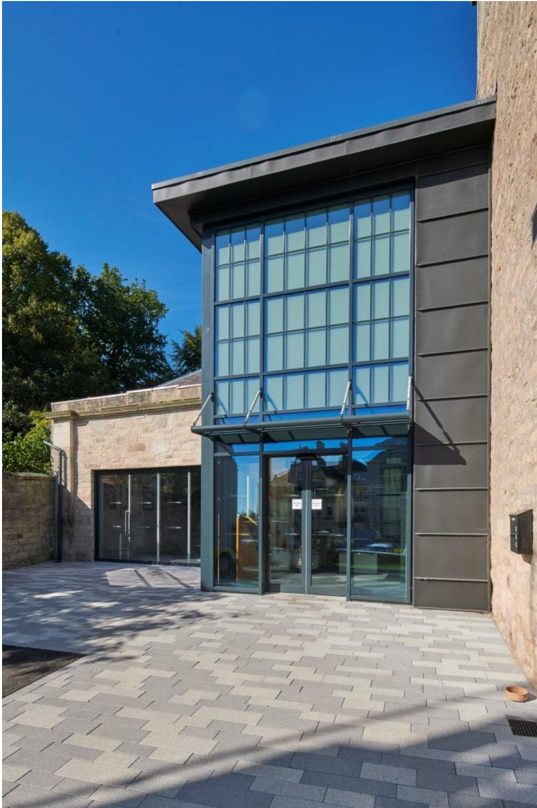
View of our main entrance